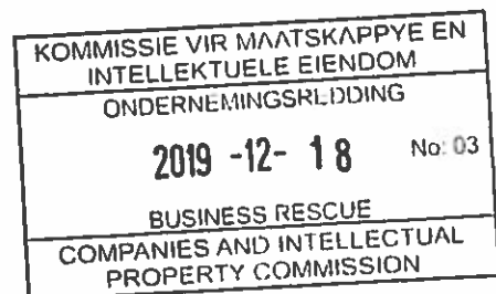
Siviwe X.A DongwanaAA